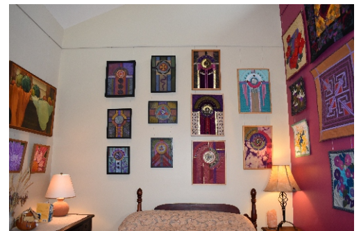
Old and new together at last