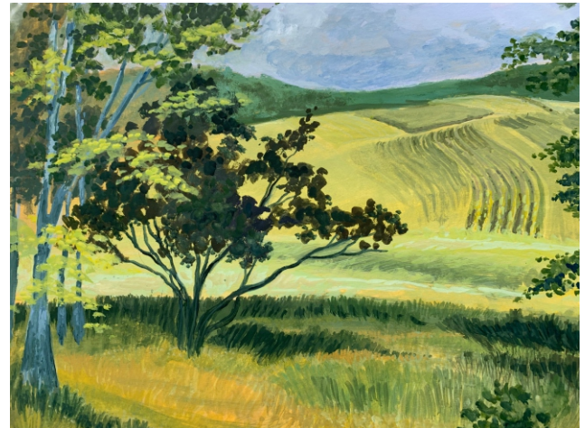
The Prize Winner