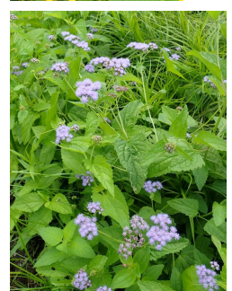
Conoclinium coelestinum. Blue mist flower, hardy ageratum. Droughttolerant, easy to grow.