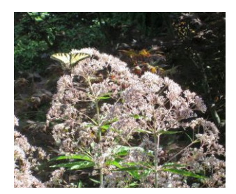
Joe Pye weed. Multiple species. 4-12'. Common on riverbanks and in wet meadows. Hollow stems used by cavity-nesting insects.