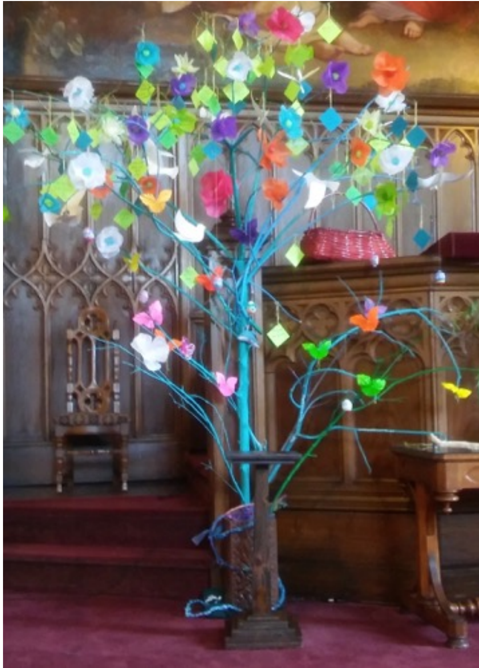
Design & Photo by Jane Tumas-Serna

Send in your drawings or photos of a Tree of Life